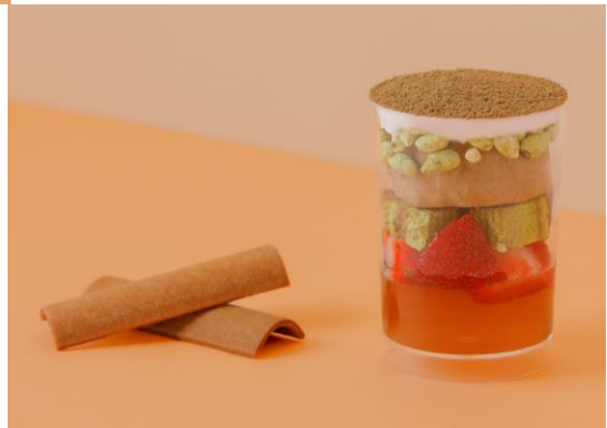
❄️ Winter Only Yuzu and Vanilla Ice Cream Parfait