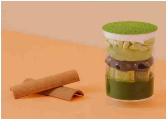
Tanba Black Bean and Matcha Parfait

Once you see Karaku's original Kyo-parfait, you'll want to take a photo. There are 3 types to choose from.